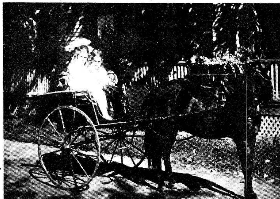
Elizabeth Carver and her brother, Bill, are all dressed up in their Sunday best and ready for an outing in their pony cart.

This the article No. 13 in the continuing WESTFORD RECOLLECTIONS - 250th Anniversary Series.