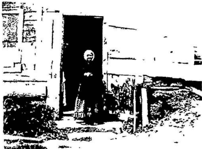
O'Toole's house in Texas, Westford, Mass

One picture features the Farm while the other features the O'Toole House in "Texas" - Texas Road - Parker Village. The O'Tooles were interesting characters of the early days who spent their last years at the Poorhouse.