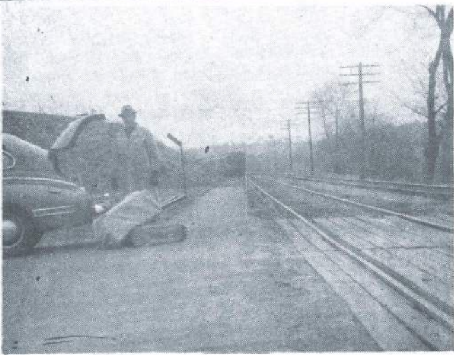
End of an era! Last train pulls away and Mr. Shupe loads last of mail into car for trip to Post Office.