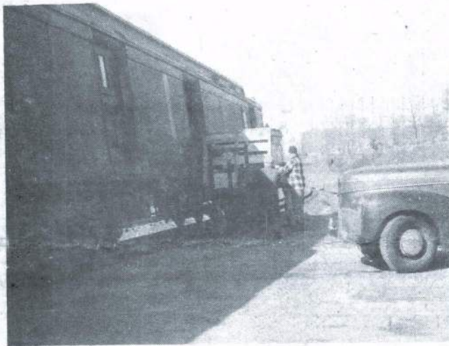
Unloading "Scottish Highlander bull calf" in crate destined to Allister F. MacDougall of Westford.