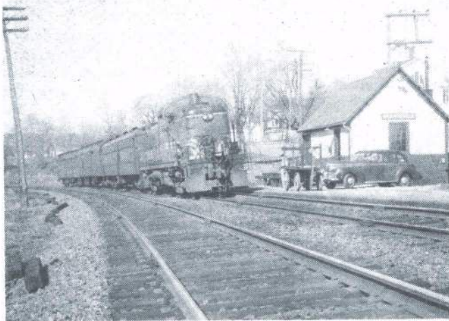
Morning passenger train arrives Graniteville station.