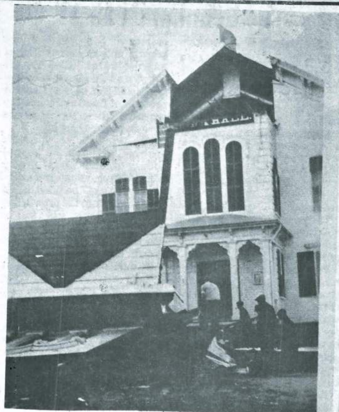
Town Hall in the process of being renovated after the 1938 hurricane.