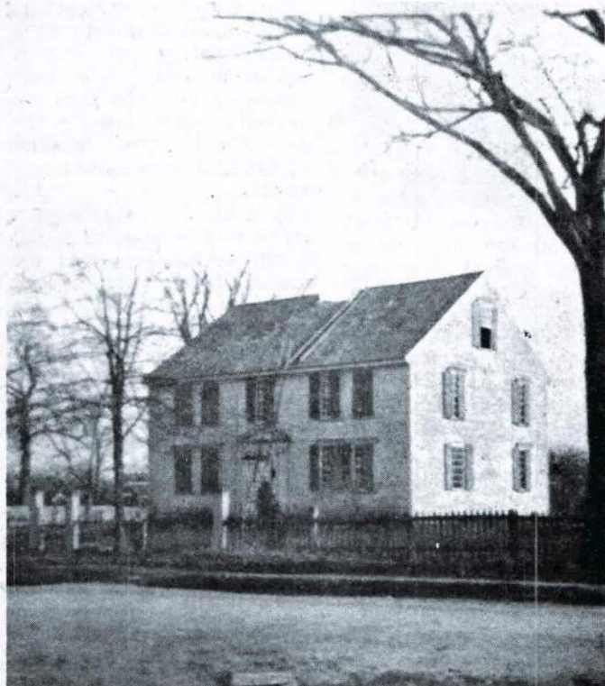
The Sullivan Homestead, Westford Center, as it appeared in the early 1900's.