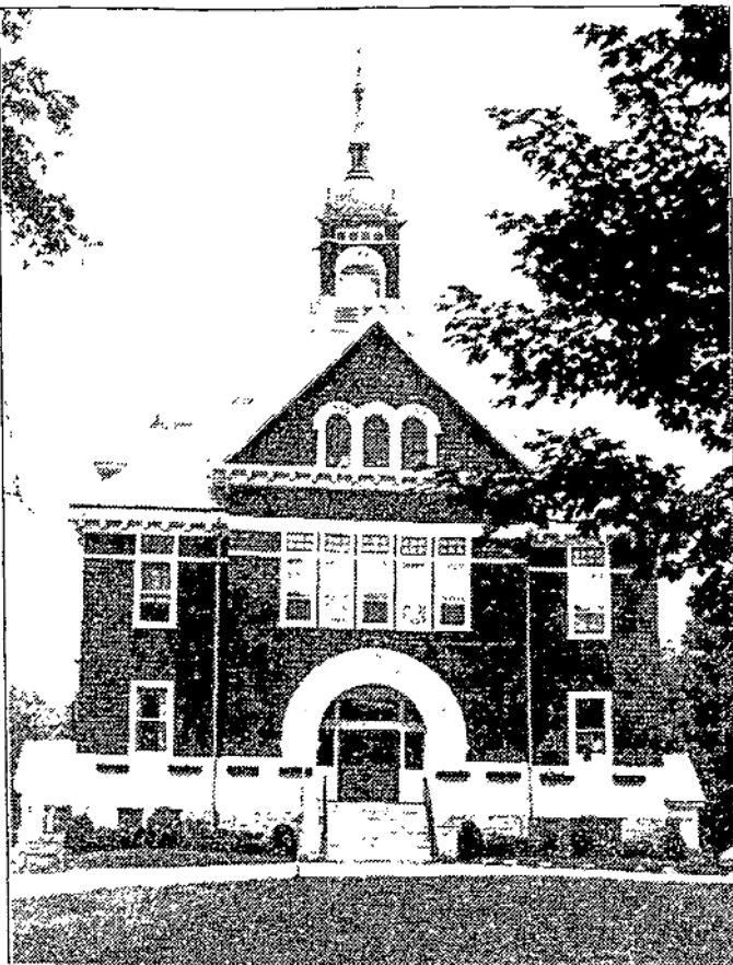
Roudenbush Community Center

Born in Westford in the year 1844, he lived to be 85 years old. One of his favorite organizations was Troop F Cavalry, Mas-