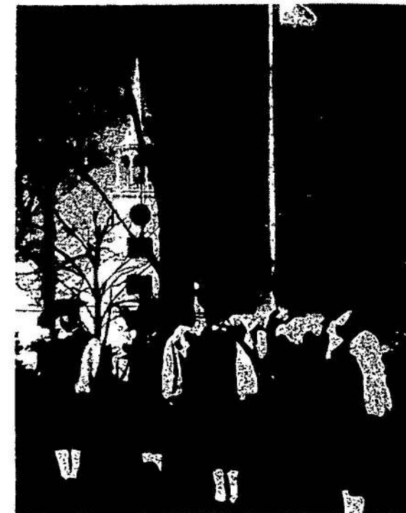
Reminiscent of the 130 Westford Minutemen who fought at Concord.