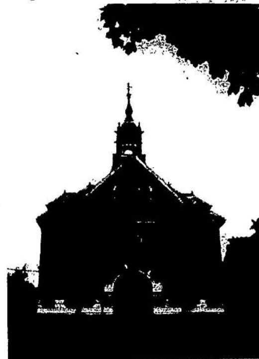
Towering Victorian style marks the Roudenbush Community Center.